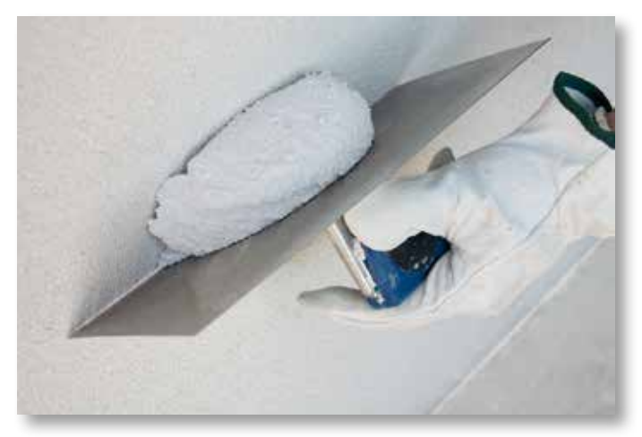
Applycation using a smooth-edged trowel

Afontermo® can be painted using Pittura thermo fotocatalitica Afon casa Fore more details regarding the application see the technical datasheet.