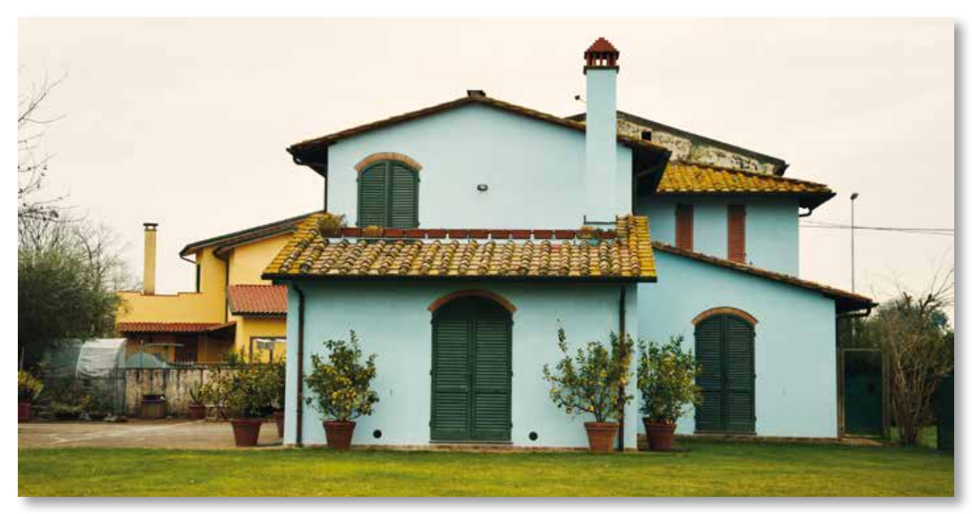
PISA: Facade treated with Afontermo®