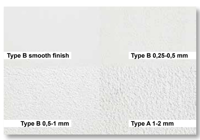
Grain size of the various finishes