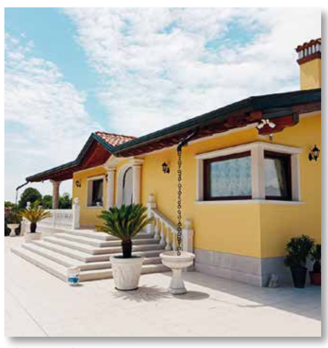
PORDENONE: Facade treated with Afontermo®