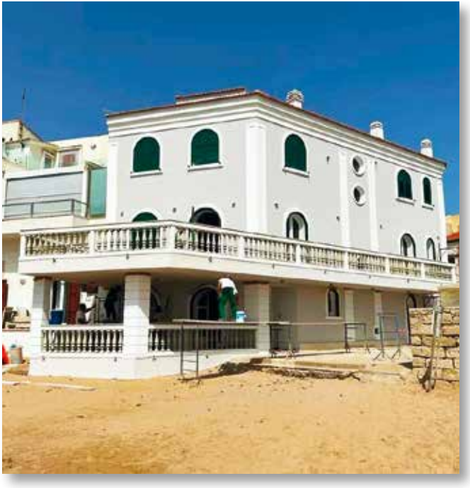
THE HOUSE OF "MONTALBANO" (RG): Facade treated with Afontermo®